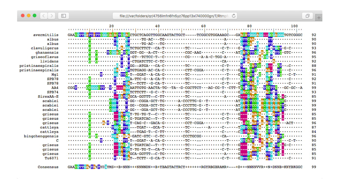
Figure 2: Amplicon with the target site for each primer colored